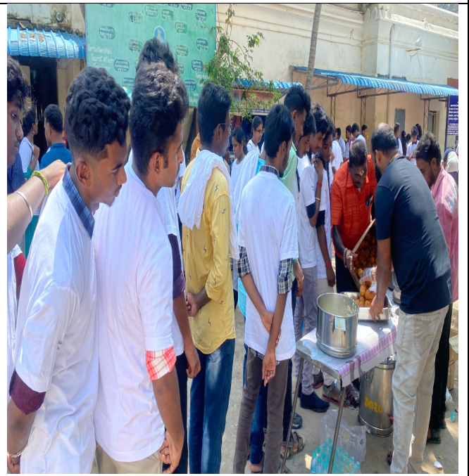
NSS Volunteers Walking Towards Thanjavur Palace